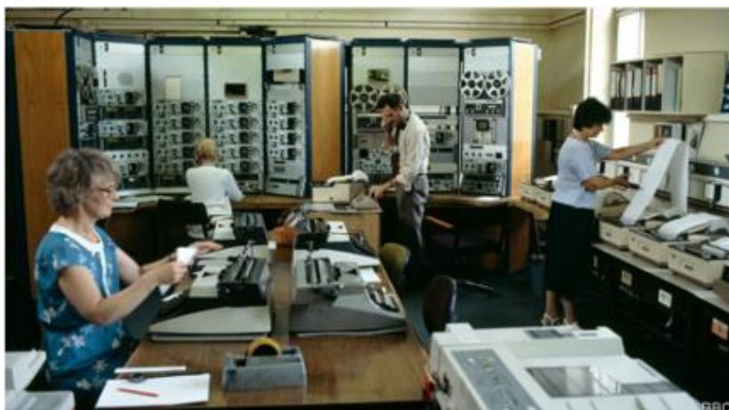
Picture shows - Staff in the office at work in BBC Monitoring, Caversham Park

https://archive.ph/Bk7Ei The Economist, Feb 20th 2023